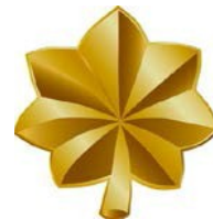
Qualified/Aircraft Commander 3-skill level